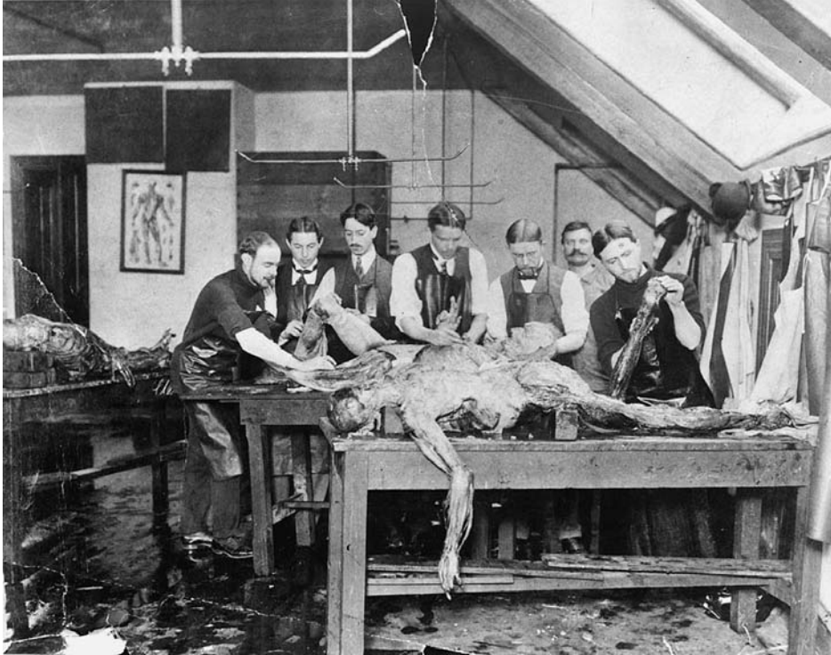
Medical Students at Work on a Cadaver, 1890 Human dissection is a unique learning experience that links every freshman medical student with previous generations of physicians.

thology (e.g., “cheesy necrosis”). Clinical work brings an onslaught of abbreviations, many of which are used in different ways by different specialists (e.g., MS can refer to either multiple sclerosis or morphine sulfate).