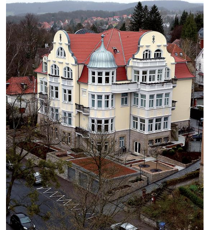
Headquarters of the Hogrefe Publishing Group, Göttingen